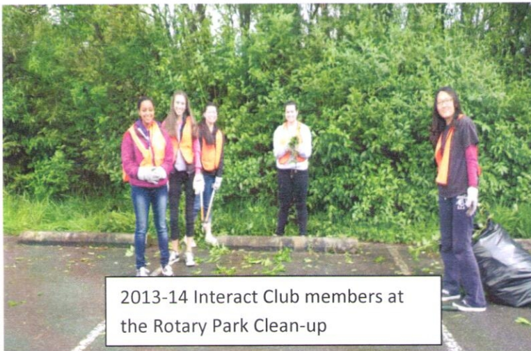
2013-14 Interact Club members at the Rotary Park Clean-up

Everett Rotary Youth Foundation Rotary Club of Everett P.O. Box 1225 - Everett, WA 98206 425-259-9141 evrotary@evrotary.org