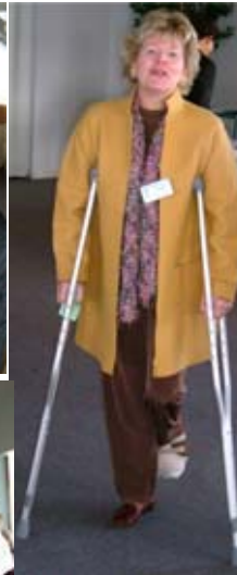
Fontelle features faulty footie!