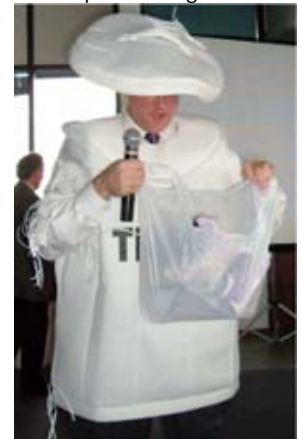
...and engages in trash talk....