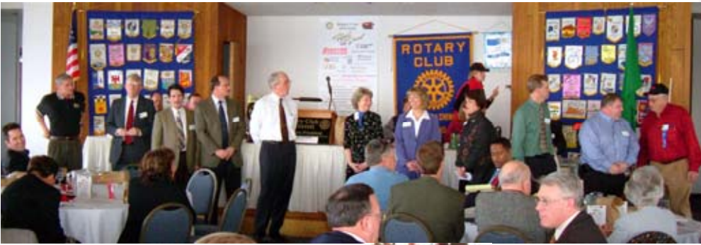
Route Foremen installation excitement!

What fun we had at the kick-off of our campaign to practice SERVICE ABOVE SELF and participate fully in the HAUL OF FAME ...at our March 8th meeting we will be drawing the name of two successful solicitors. One will be awarded a $1,000 men's or women's watch (winners choice) and the other awarded round trip Delta Airline tickets for two anywhere in the Continental US or Alaska! At our meeting on March 15th, all successful solicitors will participate in the Grand Prize drawing for these contributed adventures: Condo week in Whistler; Condo week in Cabo Mexico w/airfare for 2, and a 7 day Holland America Cruise for 2 w/airfare, winners choice of many destinations!