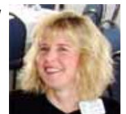
Renee Quistorf Women's Clothes

"As a hunter, let me say that bargaining with terrorists is unacceptable. We apologize for any inconvenience this may cause for hostages."